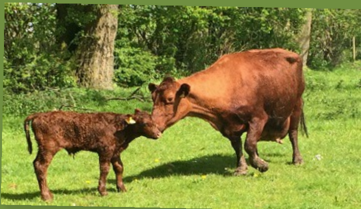
Red Poll cow and new calf.

Open Farm Sunday is on 7th June, and is farming's national open day administered by LEAF (Linking Environment And Farming). All are welcome at the farm and Trafford Mill from 10:00 a.m. to 4:00 p.m.